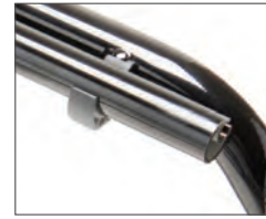
3 ALUMINUM SEAT RAIL With integrated seat slider for better seat sling support