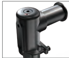
5 ANTI-FLUTTER SYSTEM Provides a smooth, more efficient ride