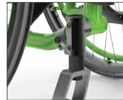
6 INTEGRATED CASTER HOUSING Offers simple and infinite angle adjustments