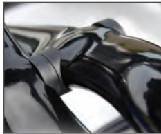
4 ULTRARIGID FOLDING SYSTEM Offers best-in-class propulsion efficiency