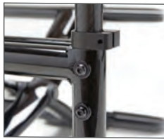
1 REINFORCED BACK CANE SUPPORT For added stability and comfort